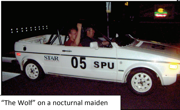
"The Wolf" on a nocturnal maiden voyage through Sellwood.