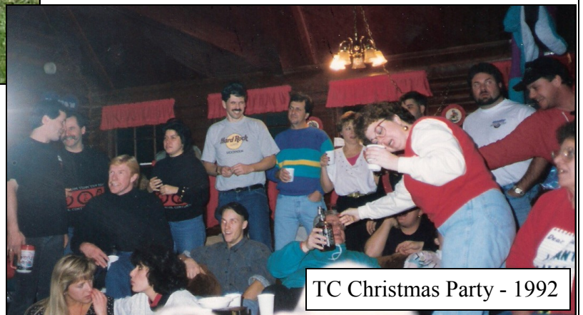
TC Christmas Party - 1992