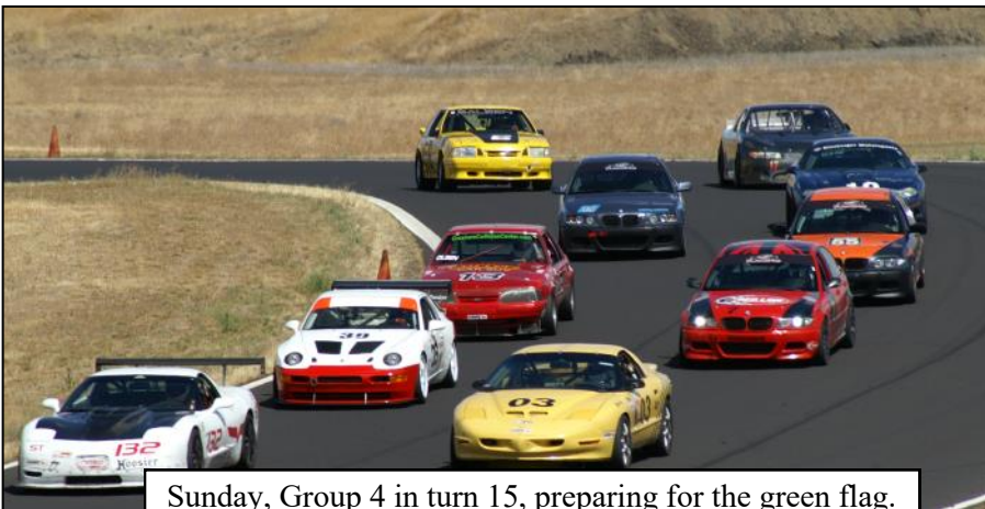
Sunday, Group 4 in turn 15, preparing for the green flag.