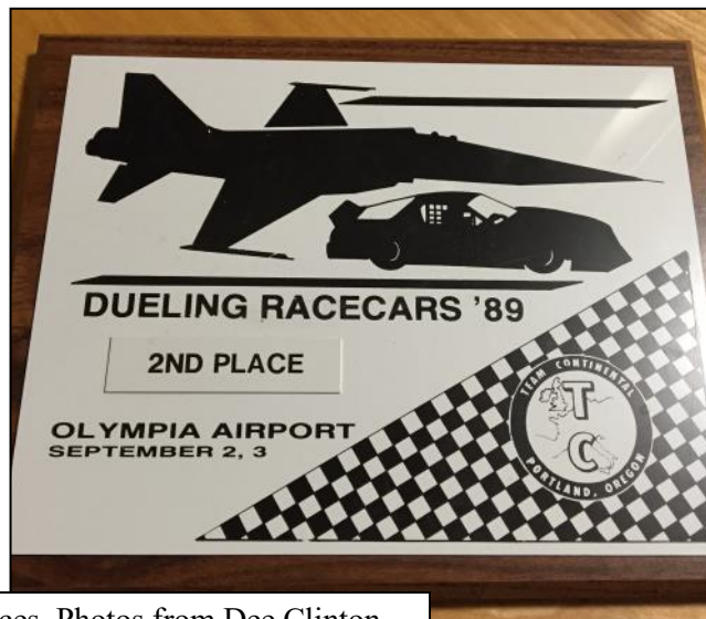
Trophies from '87 &amp; '89 OLY races.