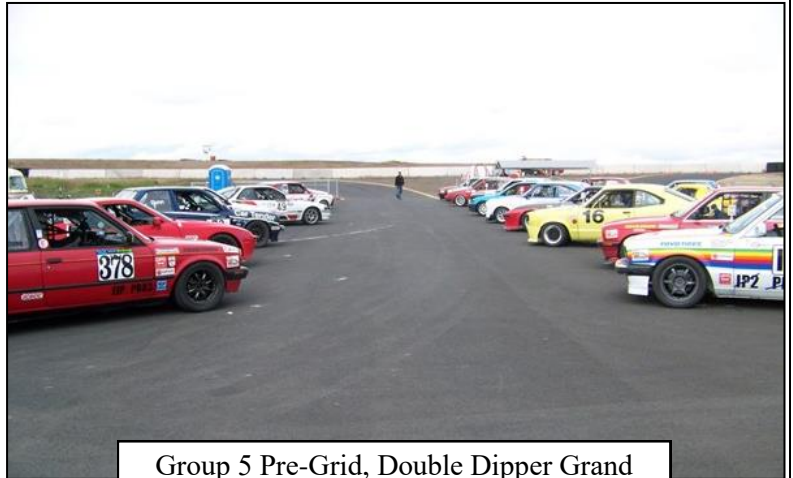
Group 5 Pre-Grid, Double Dipper Grand Prix, ORP, May 2011