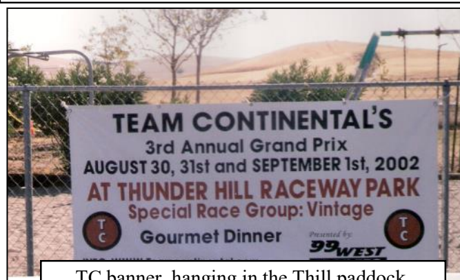
TC banner, hanging in the Thill paddock.