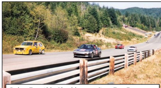
Labor Day '99. Checking out Coos Bay Raceway.