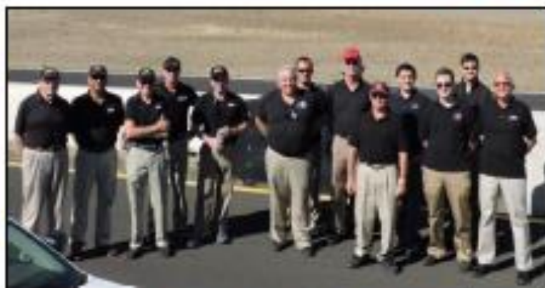
Instructors await their students at one of last season's private track days.