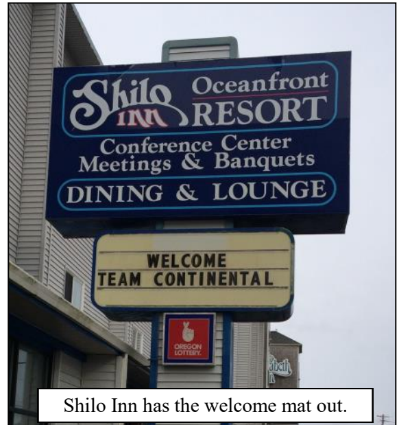
Shilo Inn has the welcome mat out.