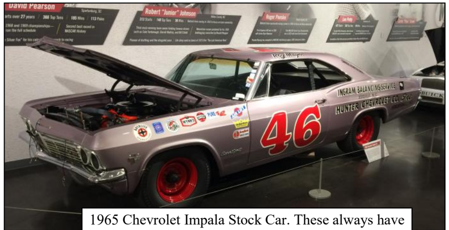
1965 Chevrolet Impala Stock Car. These always have interesting engineering if you can look closely.