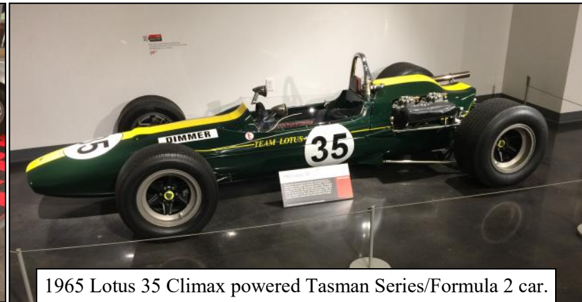
1965 Lotus 35 Climax powered Tasman Series/Formula 2 car.