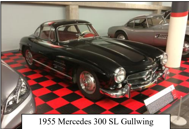
1955 Mercedes 300 SL Gullwing