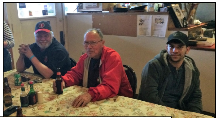
Saturday night, dinner at the Goose Pit.