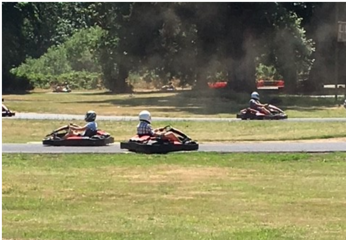
One of these things is not like the others