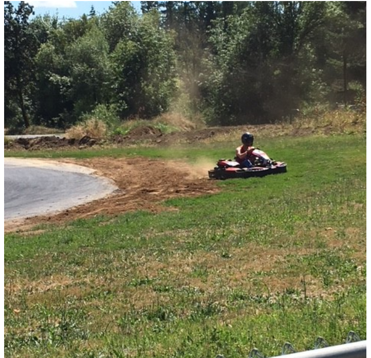
Driver discovers the effect of exceeding the limit of miniature tire adhesion