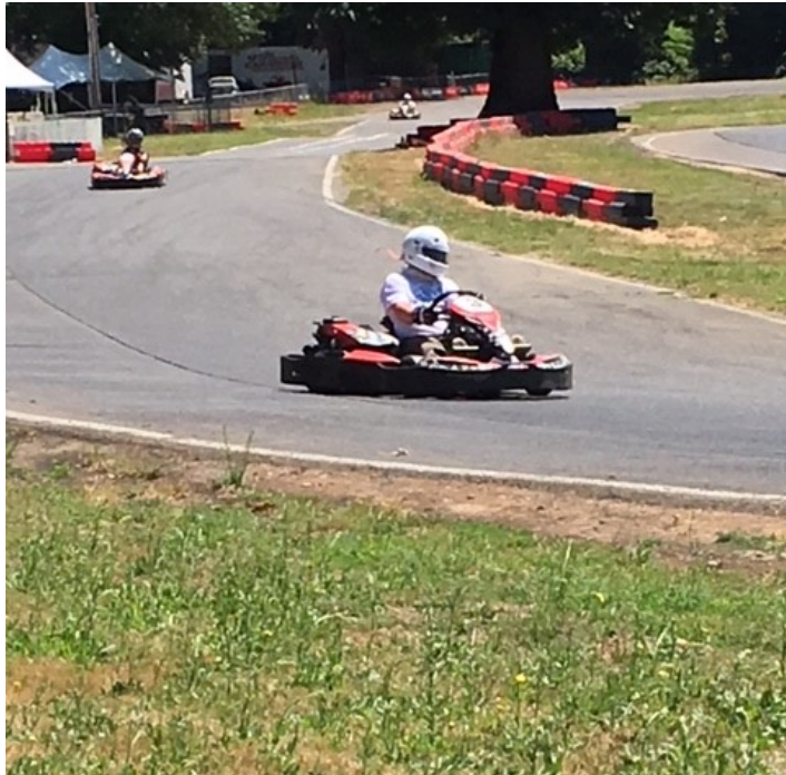
A beautiful day for a picnic... and karts