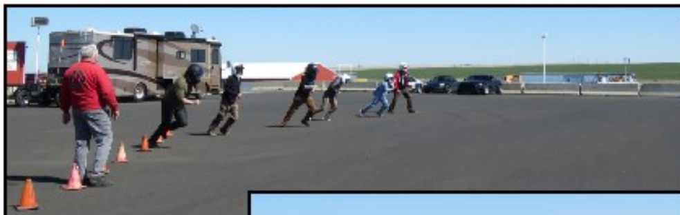
STAR Projects Driver Training, March 27 th . A variety of practice starts were on the curriculum: 2 x 2 rolling grid, single file restart, and the most classic of all ....