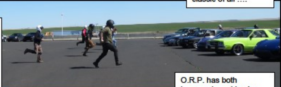
O.R.P. has both Lemmon's and Lucky Dog Racing League events scheduled for this season. There will be STAR practice days on Friday before both races and both are open to H.P.D.E. drivers as well.