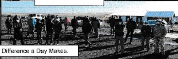
A Tale of Two Driver Meetings, or What a Difference a Day Makes.