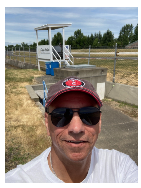
Yours truly. Or possibly Joe Biden. We're not sure.