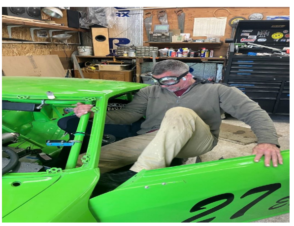
First drive. All went well. No cops showed up.