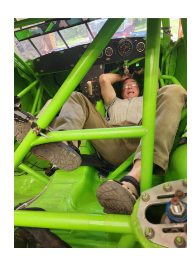
Nothing worse than under dash work