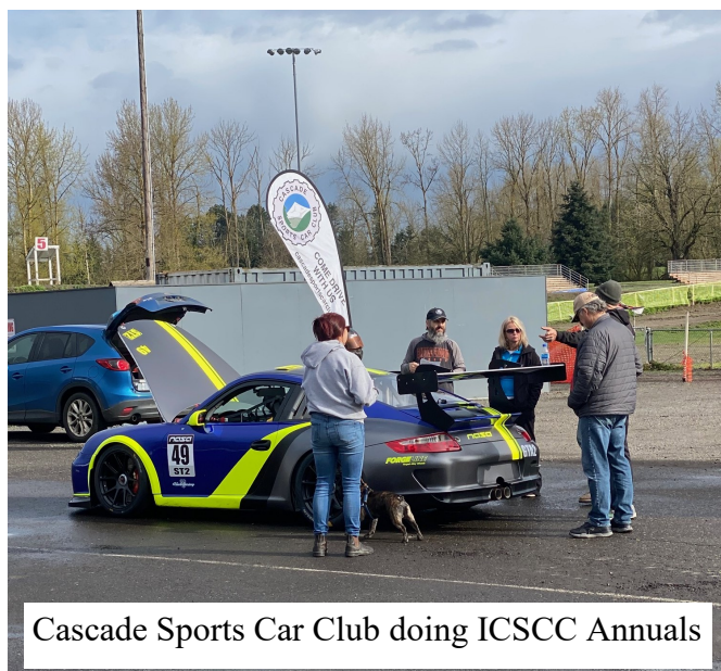
Cascade Sports Car Club doing ICSCC Annuals