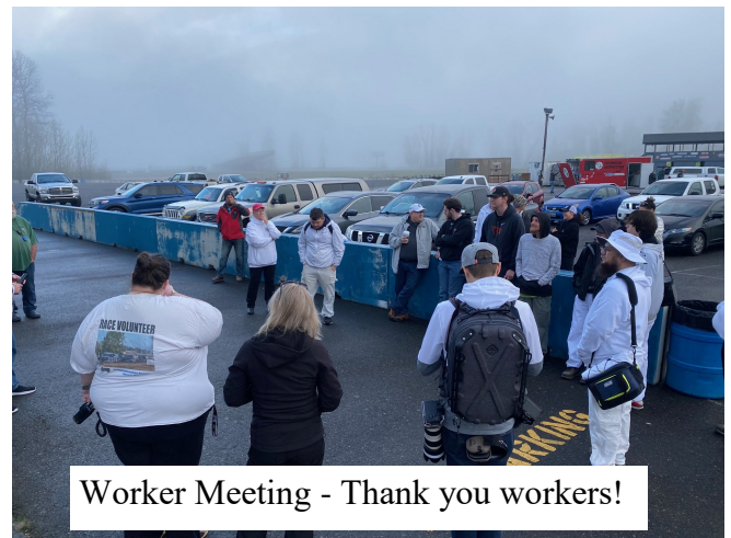
Worker Meeting - Thank you workers!