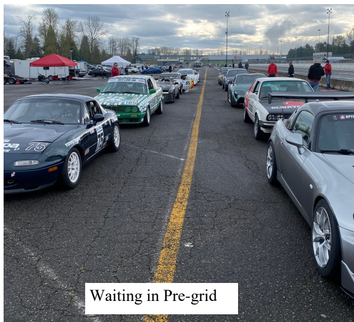
Waiting in Pre-grid