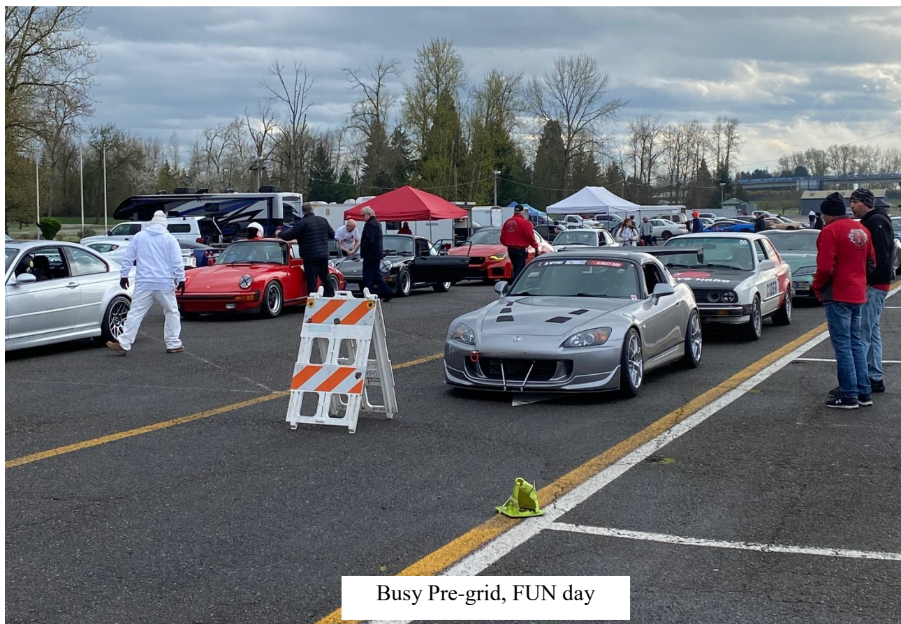
Busy Pre-grid, FUN day