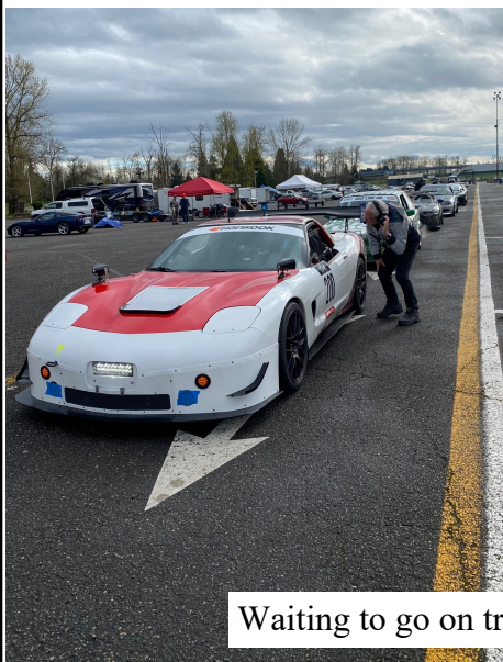
Waiting to go on track