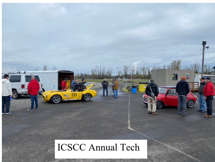
ICSCC Annual Tech