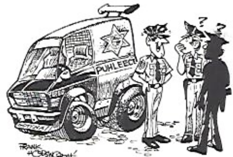
This unit actually locks onto the Radar Detector for a clean "KILL"!